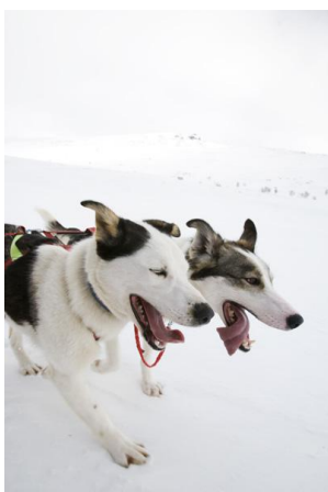
Sky and Greta in the move.

The 11 young dogs are all doing very well and all of them have been out on at least one long tour. They look very good, are happy, social and good pullers. One of Sessans puppies – Sky, is death but she is doing okay and she is very cute.